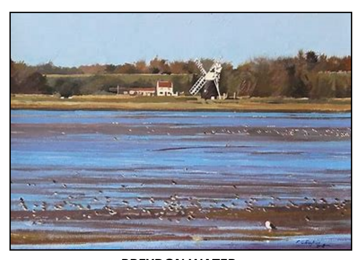
BREYDON WATER (photo courtesy of frankcallaghanart.co.uk)

Adults £10.00 or £9.00 for early booking up to 28<sup>th</sup> February Under 18 £6.00